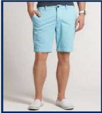
Men's twill shorts