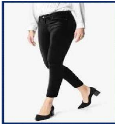
Women's woven pants