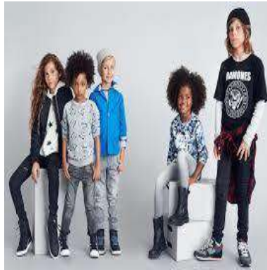
Performance wear for children