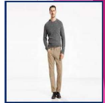
Casual long-sleeved t-shirt and pants for men- Tall