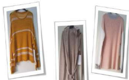
DESCRIPTION: STRIPE CROP TUBE JUMPER YARN: 55%ACRYLIC, 45%WOLLEN GAUGE: 5/6 WEIGHT: 3.40LBS/OZ